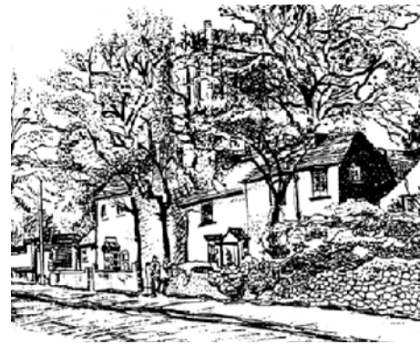
Holy Trinity from the High Street Sketch by Geoff Warburton©

Amblecote appears in the Dome- sday Book as Am-bel-coit, or Elme-le-cote the exact meaning of which is unclear but could possibly refer to the wooded or rural nature of the area. It lay on the South Western fringe of the Black Country and formed part of the Manor of Enville (Enfi- eld), property of the Earls of Sta- mford and Warrington.